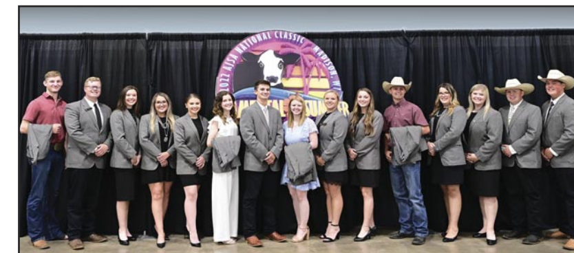
2022–2023 AJSA Trustees

Editor's Note: Check out the American Simmental Association's SimmAPP to stay up-to-date on the latest ASA, AJSA, and beef industry news. SimmAPP is available on Google Play, Apple Store, and Amazon Appstore.